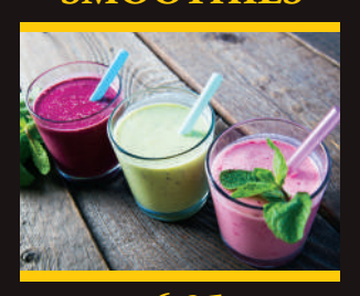
6.25 strawberry, mango, banana, peach, mixed berry